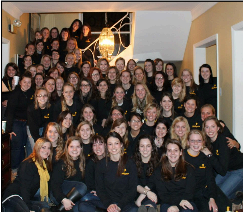
The Gamma deutron house on Spring 2012 bid night